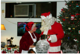
A surprise visit from Mrs. Claus delights young and old alike!